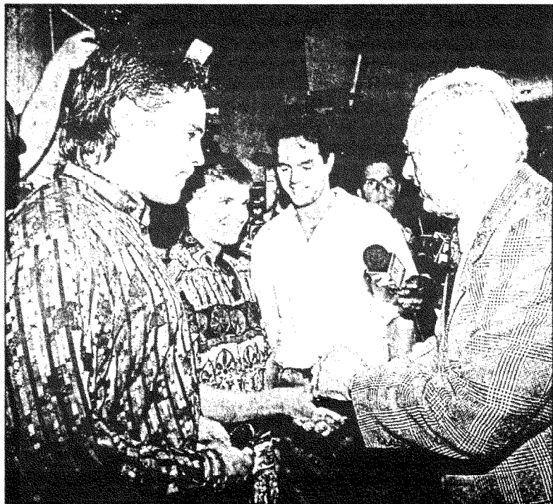
Dodger players Mike Piazza, left, and Eric Karros, second from right, offer thanks to LaSorda—do they KNOW?